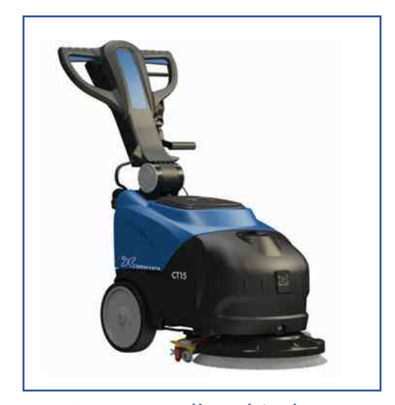
CT 15 - Walk Behind Scrubber Dryer