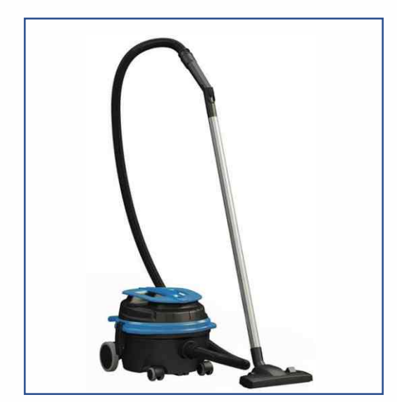
IC 12 Tub - Dry Vacuum Cleaner