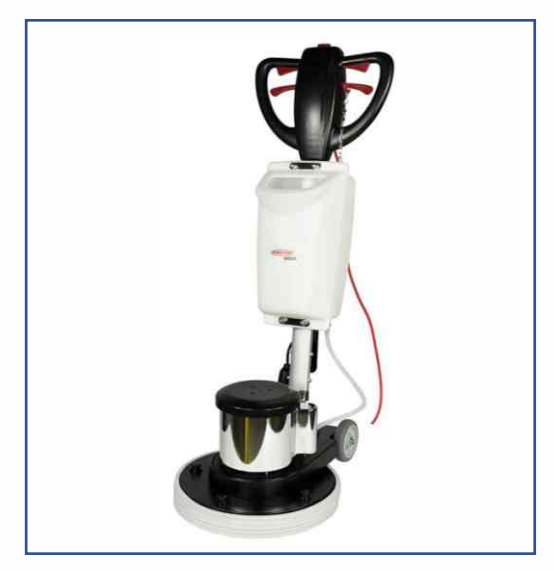
Sprintus Hercules - Heavy Duty Single Disc Machine