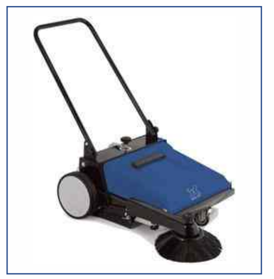
IC 510M - Manual Sweeper