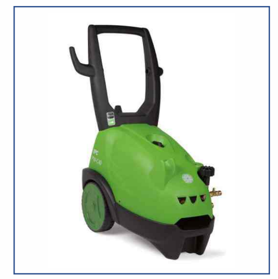
IC PW C40 3-Phase -Pressure Washer (Cold Water)