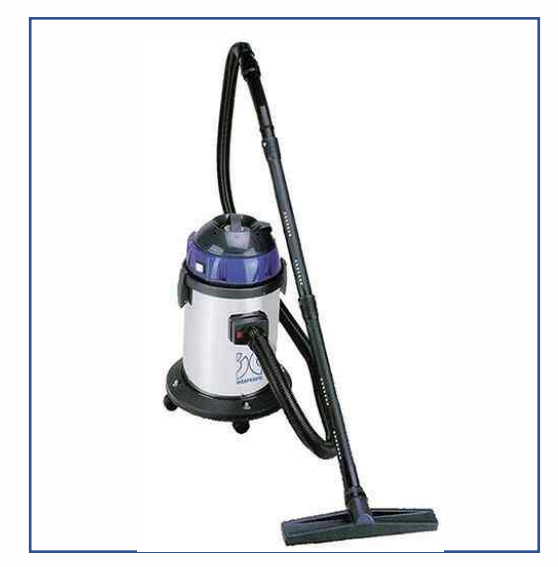
IC Professional 202 - Wet & Dry Vacuum Cleaner