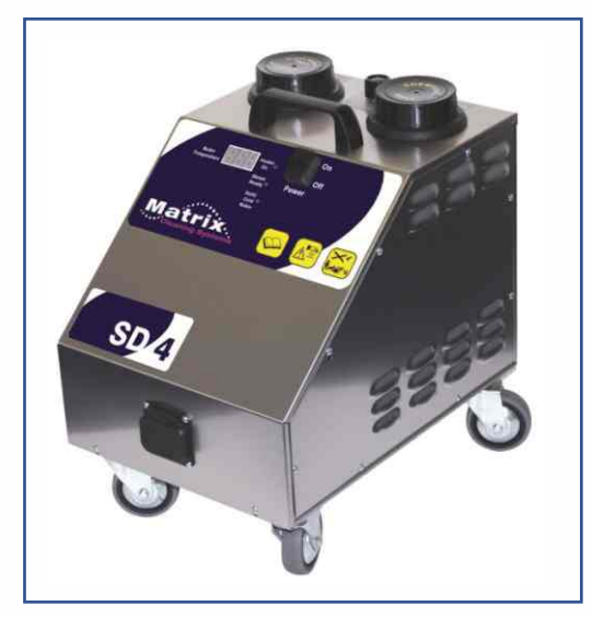
Matrix SD4 - Steam Cleaner