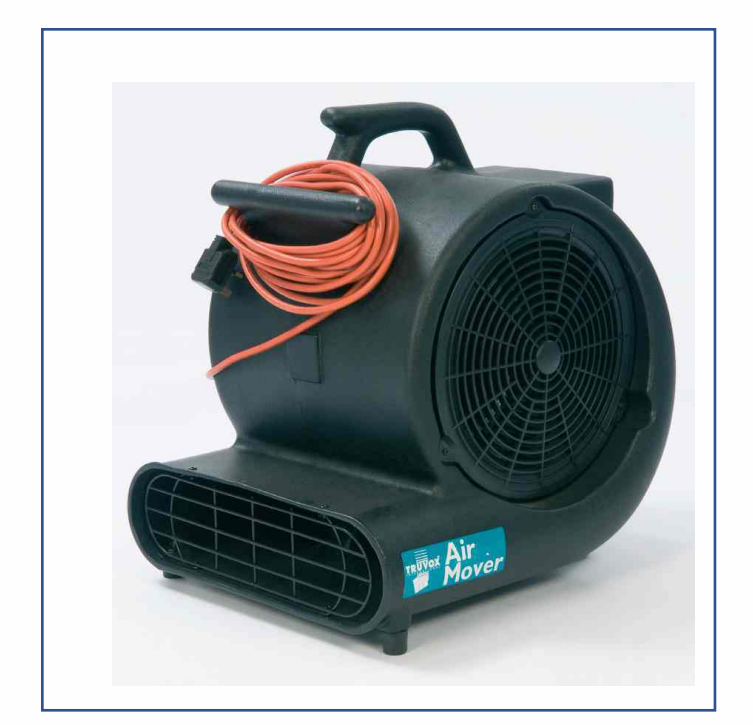
Truvox - Air Blower 3-Speed