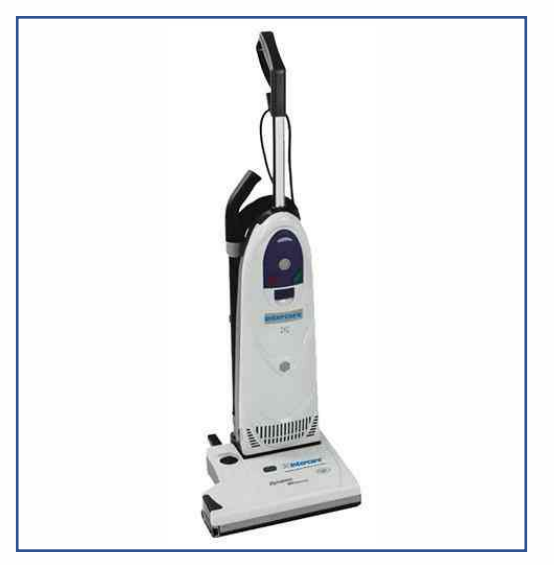
Lindhaus 380E - Upright Vacuum Cleaner