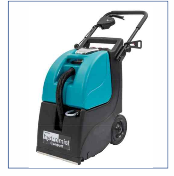
Truvox - Hydromist Compact Carpet Extractor