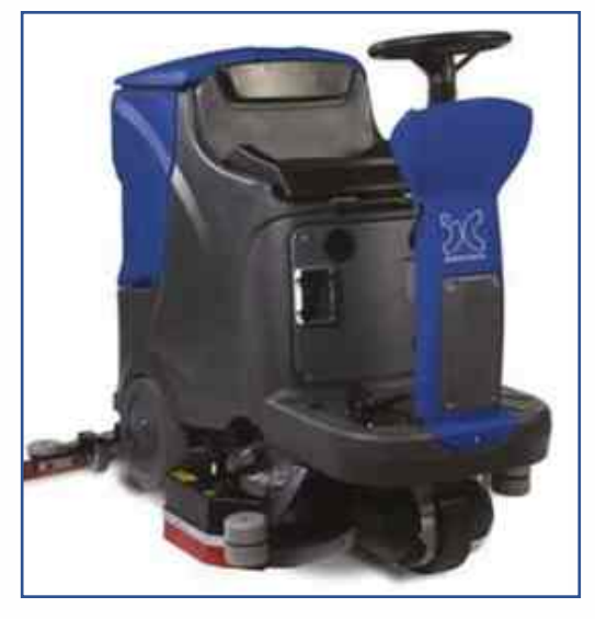
IC CT 110B85- Ride-On Scrubber Dryer