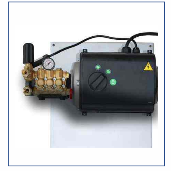
IPC MLC Single Phase -Pressure Washer (Cold Water)