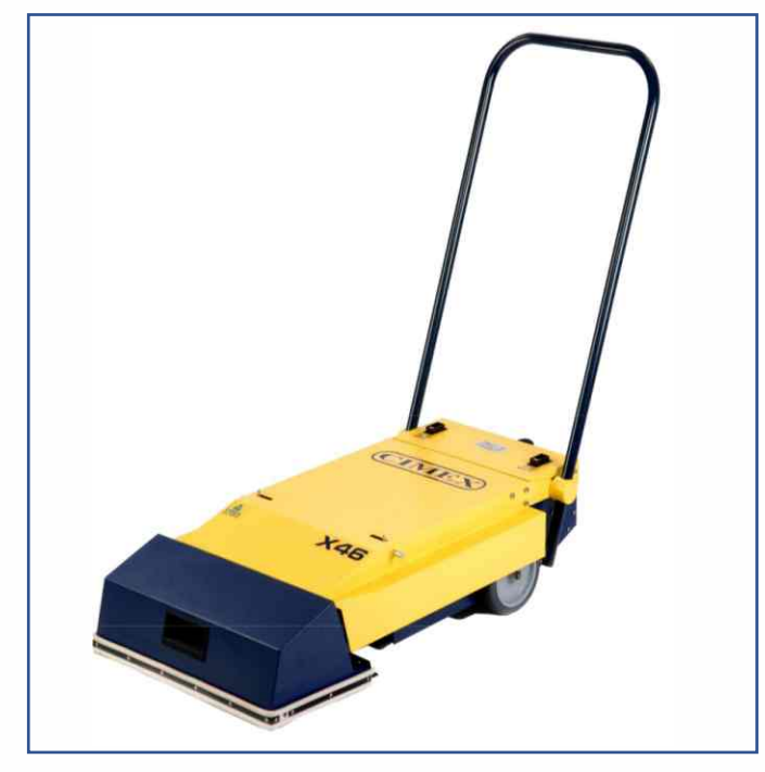
Truvox Cimex X46 - Escalator Cleaner