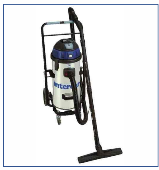
IC Professional 301 - Wet & Dry Vacuum Cleaner