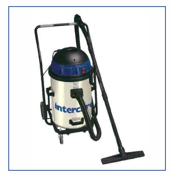
IC Professional 601 - Wet & Dry Vacuum Cleaner