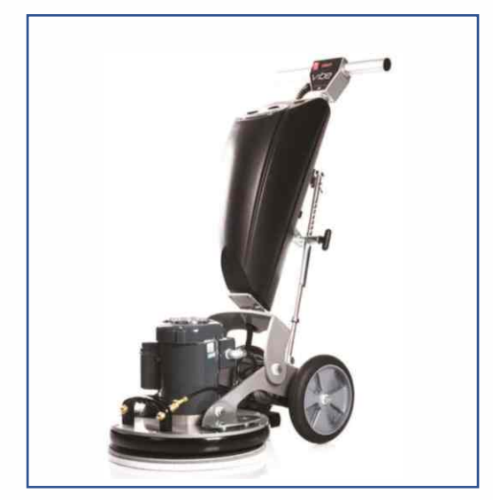
Orbot Vibe - Orbital Single Disc Machine