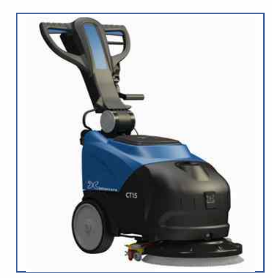
CT 30 - Walk Behind Scrubber Dryer