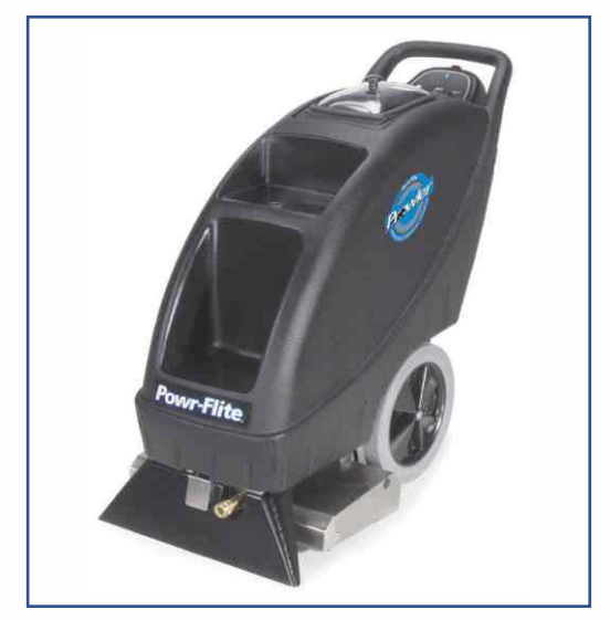
Powr Flite Prowler - Spray Extractor