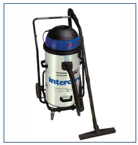
IC Professional 701 - Wet & Dry Vacuum Cleaner