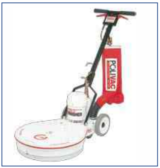
Polivac Stingray – High-Speed Single Disc Machine