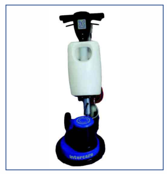
IC Orbis 200 - Low Speed Single Disc Machine