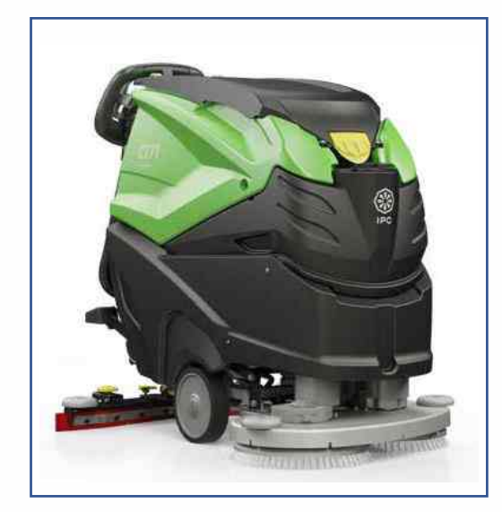
IPC CT71 – Walk Behind Scrubber Dryer