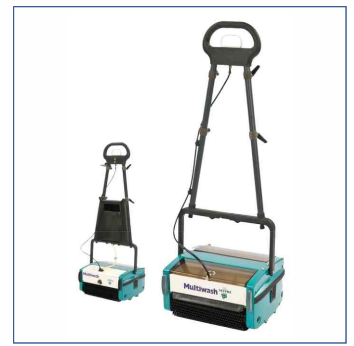
Truvox 340 and 440 - Multiwash Carpet Cleaner