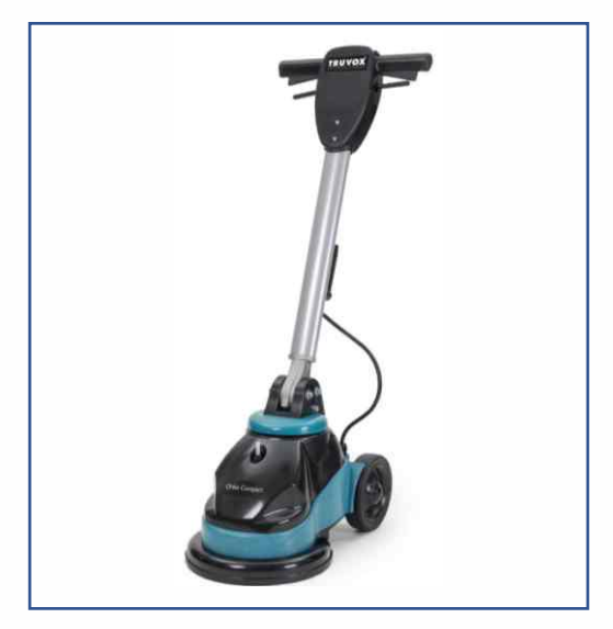
Truvox Orbis Compact - Low Speed Single Disc Machine