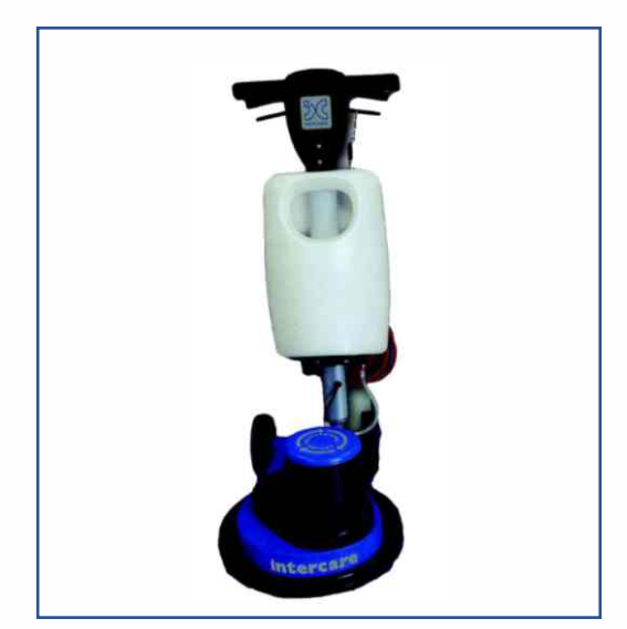
IC Orbis 400 - High Speed Single Disc Machine