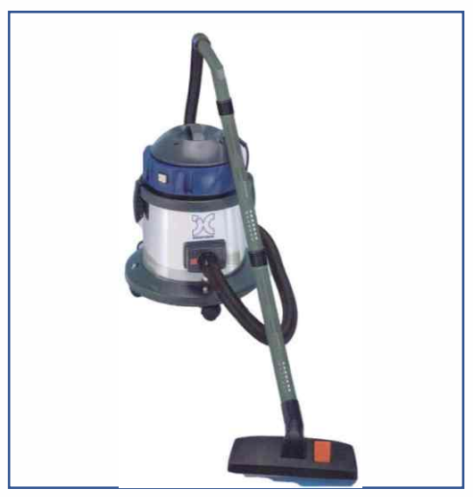
IC 101 Tub - Dry Vacuum Cleaner