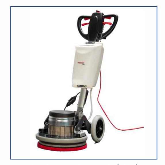
Sprintus Titan - Orbital Single Disc Machine