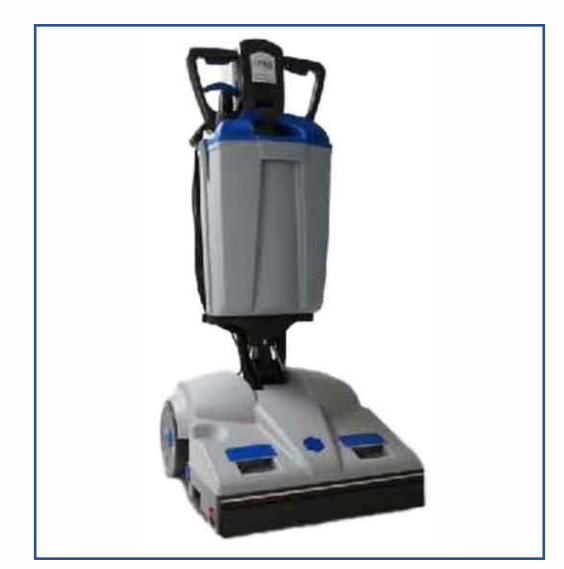
Lindhaus LS50 - Wide Area Upright Vacuum Cleaner