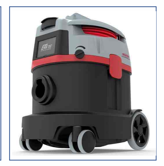
Sprintus ERA TEC Tub - Dry Vacuum Cleaner