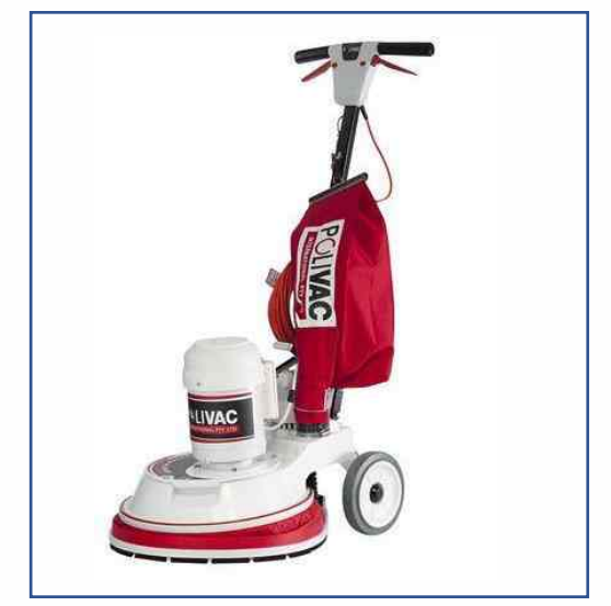
Polivac PV 25 Suction Polisher - Single Disc Machine