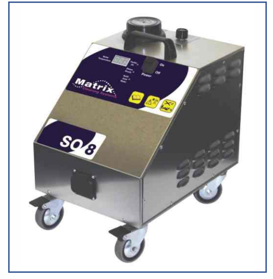
Matrix SO8 - Steam Cleaner