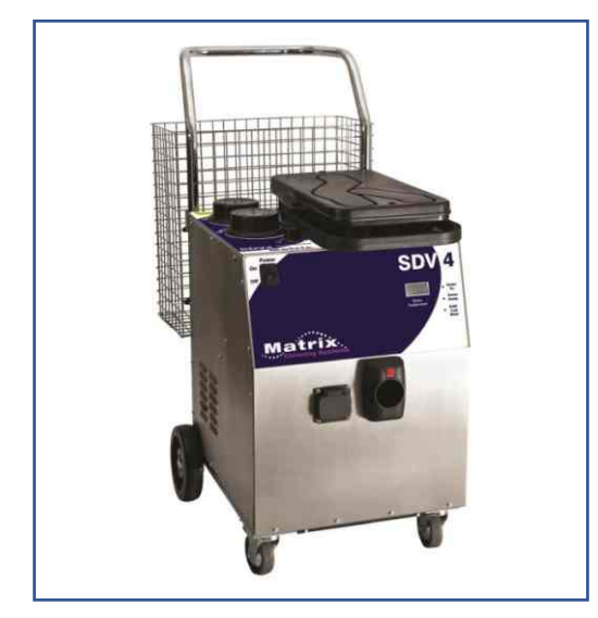
Matrix SDV4 - Steam Cleaner