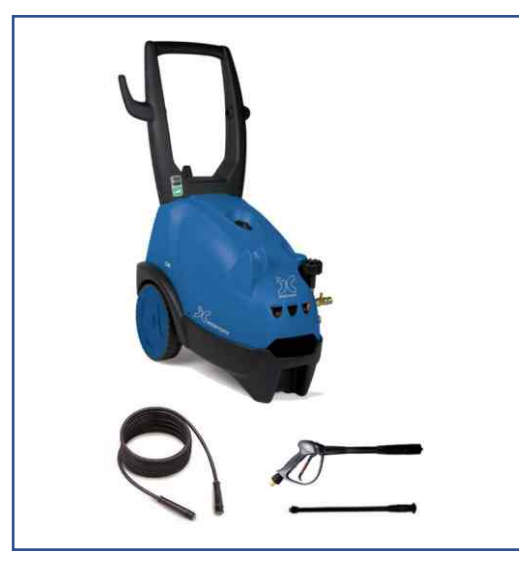
IC Firebox 40 – Hot Water Generator