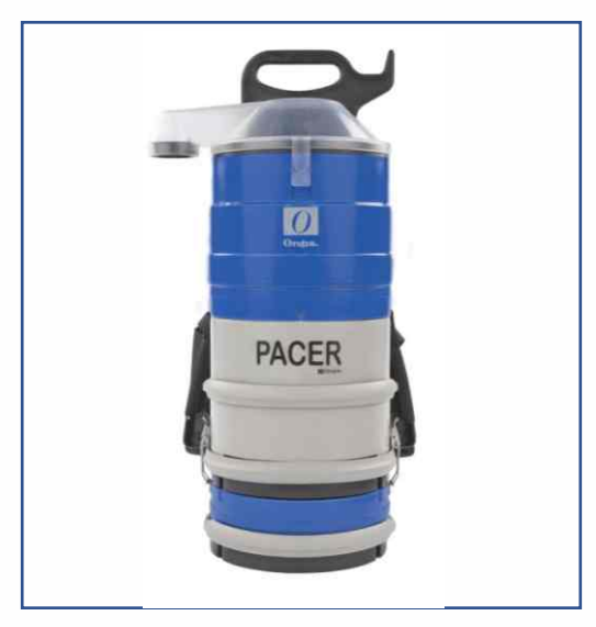
Origin Pacer - Backpack Dry Vacuum Cleaner (Battery)