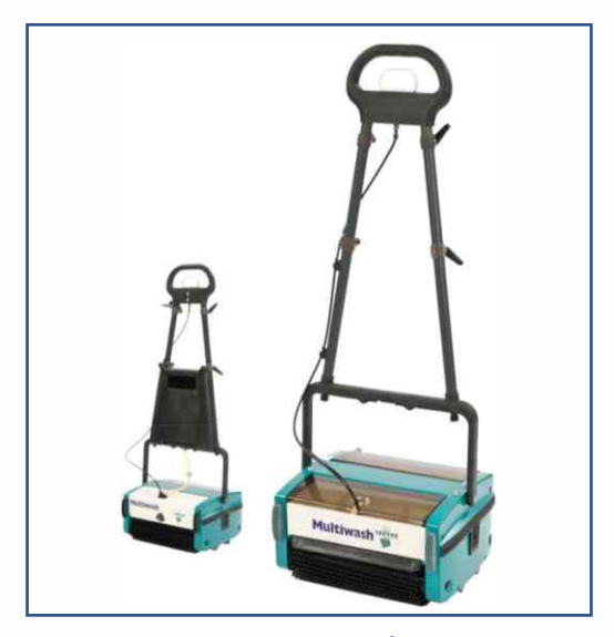
Truvox 340 and 440 -Multiwash Scrubber Dryer