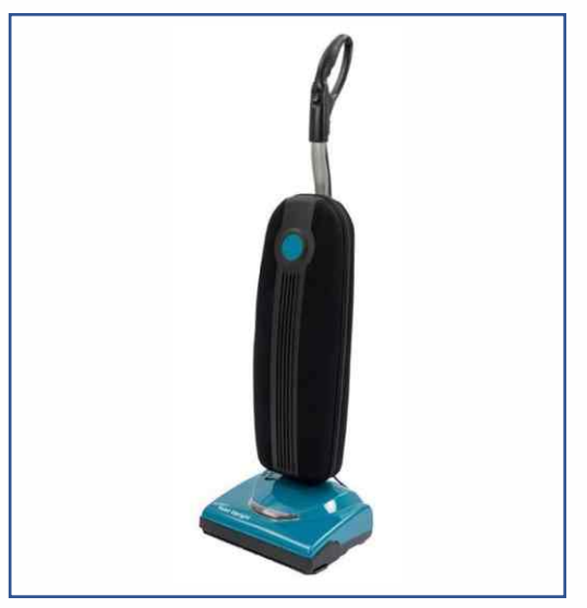
Truvox - Upright Vacuum Cleaner