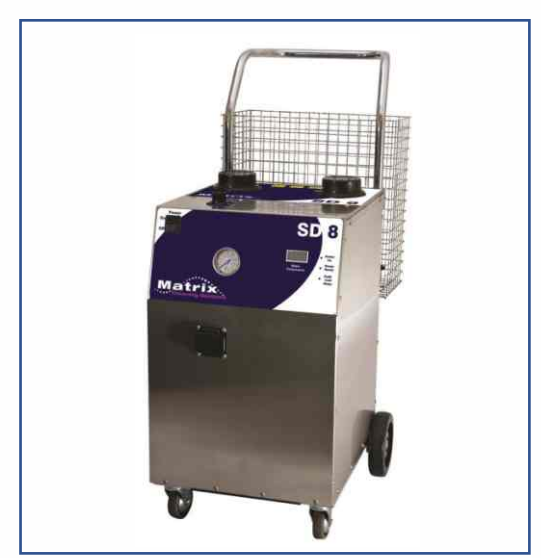
Matrix SD8 - Steam Cleaner