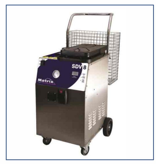
Matrix SDV8 - Steam Cleaner