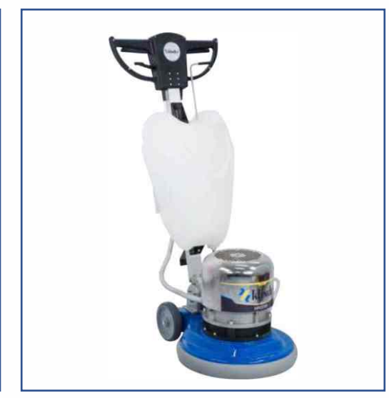
Klindex Kroma 2.5HP & 3HP - Single Disc Machine