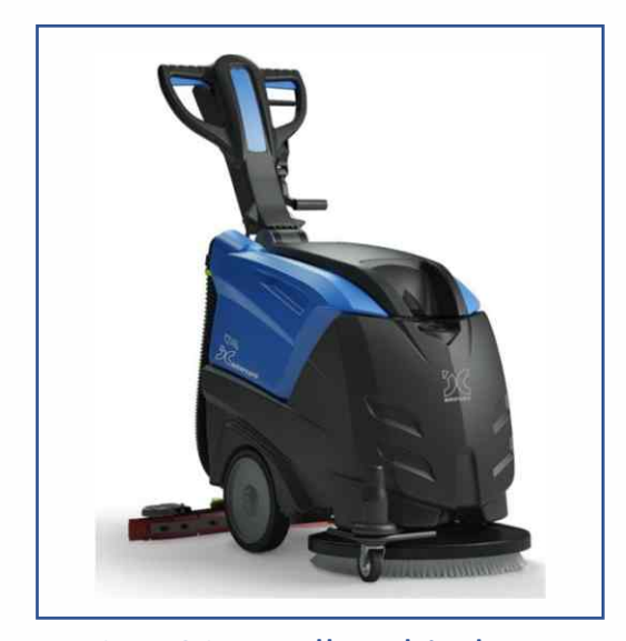
CT 46C - Walk Behind Scrubber Dryer