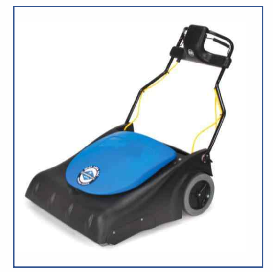
Powr Flite Valet 70 - Wide Area Dry Vacuum Cleaner