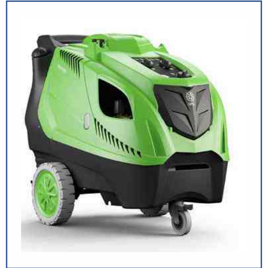
IPC E-100 - Pressure Washer (Hot Water)