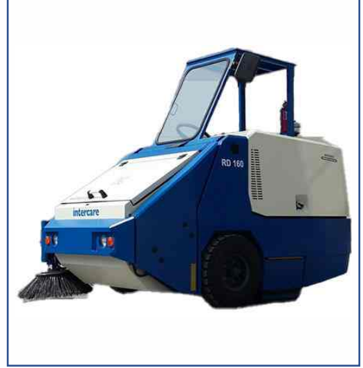
IC RD 160 - Ride-On Sweeper