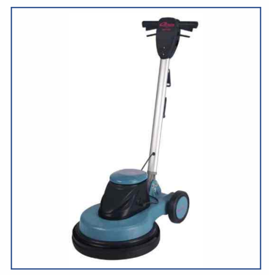
Truvox Orbis UHS 1500 -High Speed Single Disc Machine