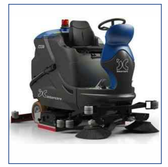
IC CT 230B100R – Ride-On Scrubber Dryer with Presweep