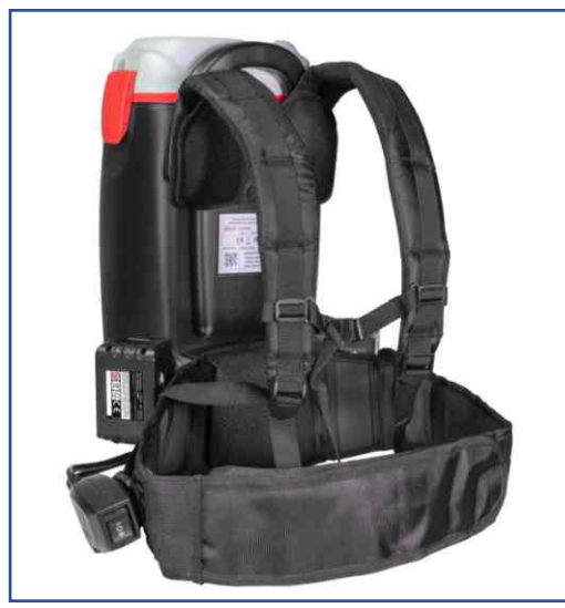
Sprintus Boostix - Backpack Vacuum Cleaner