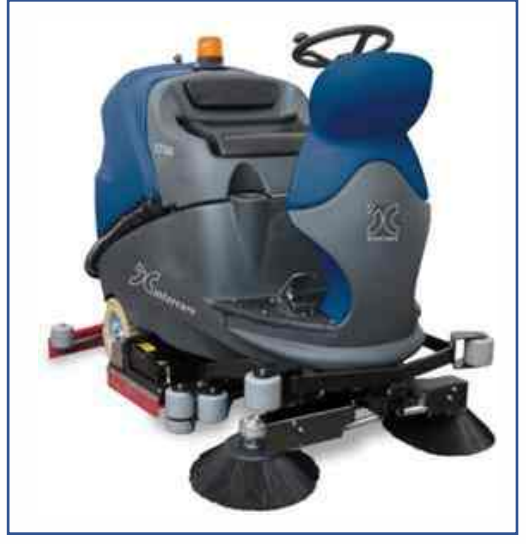
IC CT160B75R – Ride-On Scrubber Dryer