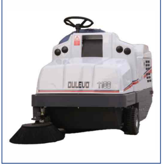
Dulevo 1100 & 1300 - Rideon Sweeper