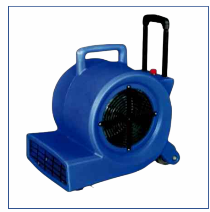
IC - Air Blower 3 Speed