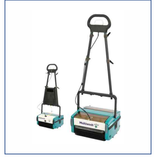
Truvox 340 and 440 -Multiwash Carpet Cleaner