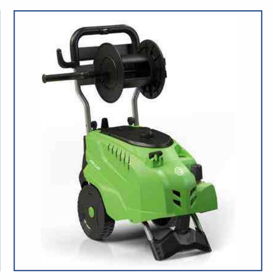
IPC C45 - Pressure Washer (Cold Water)