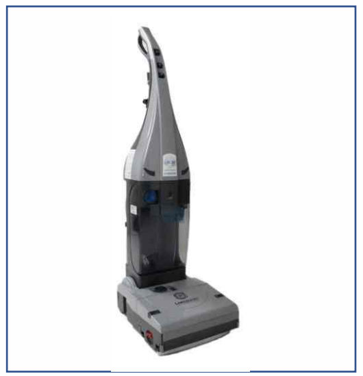
Lindhaus LW30 & LW38 – Upright Vacuum Cleaner