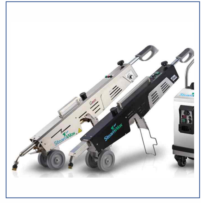
Alpina-E-Gum - Chewing Gum Remover (Walk Behind)