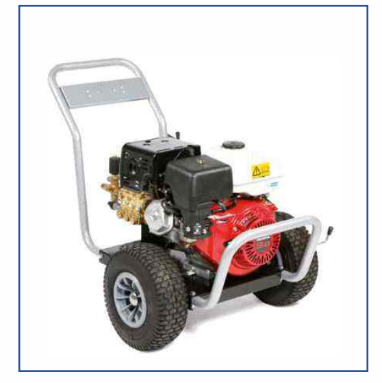
IC 200 Benz (Patrol) – Pressure Washer (Cold Water)