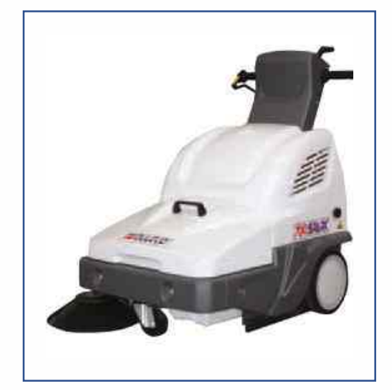
Dulevo 700M, 900, and 1000 – Manual Sweeper