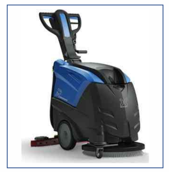
CT 46 - Walk Behind Scrubber Dryer