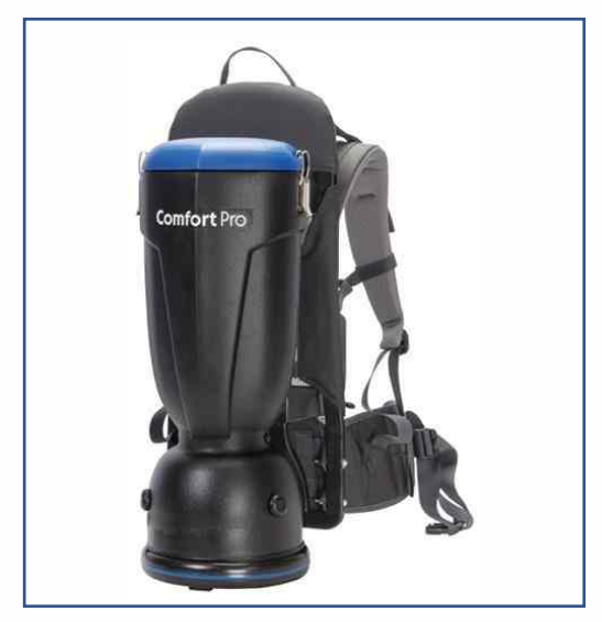
Powr Flite Comfort Pro -Backpack Dry Vacuum Cleaner