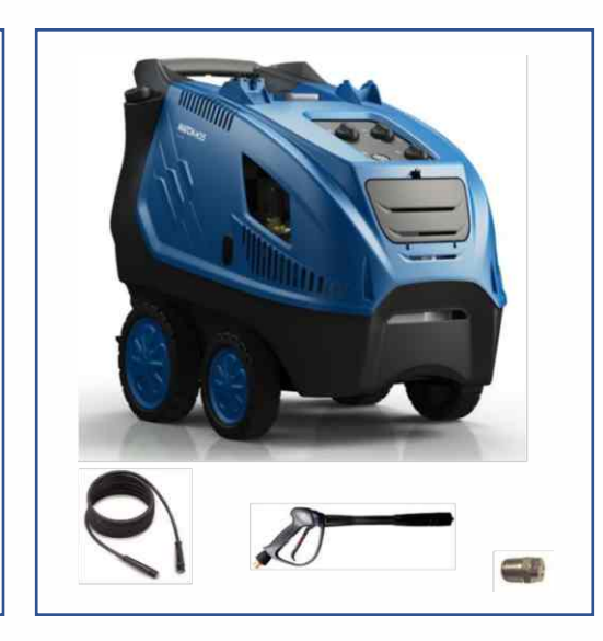
IC H50 - Pressure Washer (Hot Water)