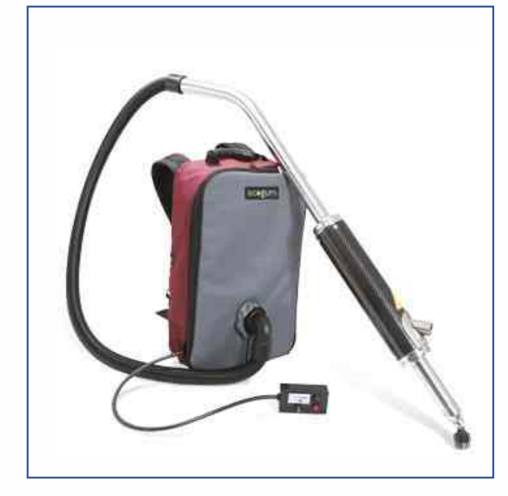
Eco Gum – Chewing Gum Removal System (Backpack Mini & Midi)