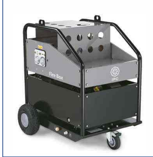
IC Firebox 40 – Hot Water Generator