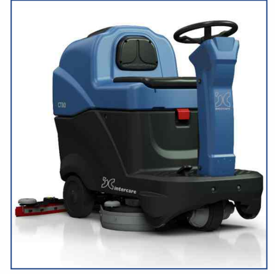
IC CT 80B55 – Ride-On Scrubber Dryer