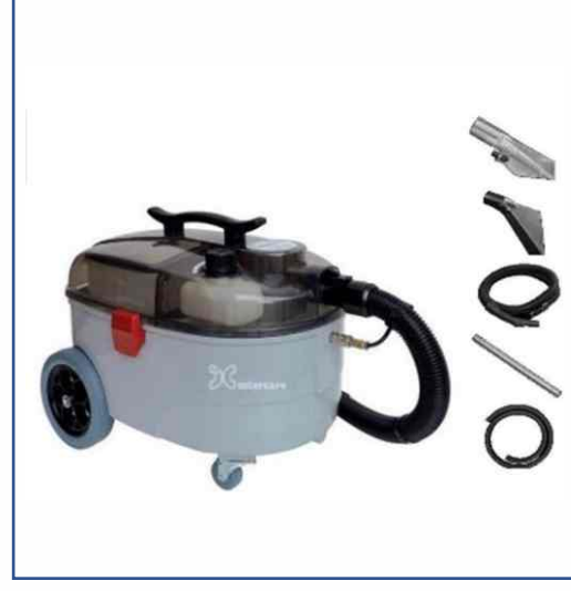
Sprintus SE7 - Upholstery Cleaner