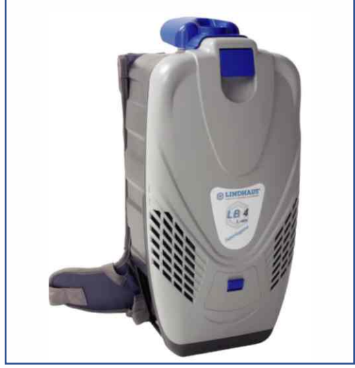
Lindhaus LB4 - Backpack Dry Vacuum Cleaner