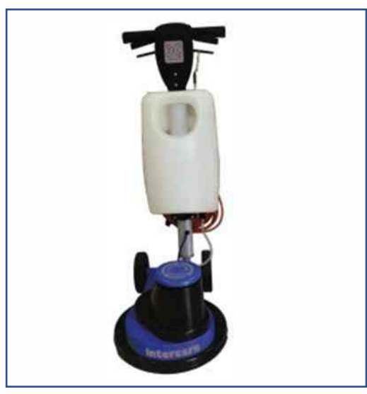
IC Orbis Dual Speed - Single Disc Machine