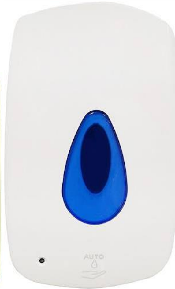
Multiflex -Touchfree Soap Dispenser