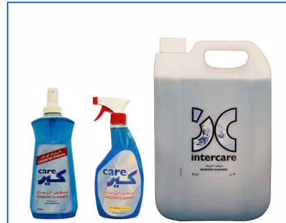
Glass Window Cleaner