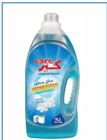
Liquid Laundry Detergent