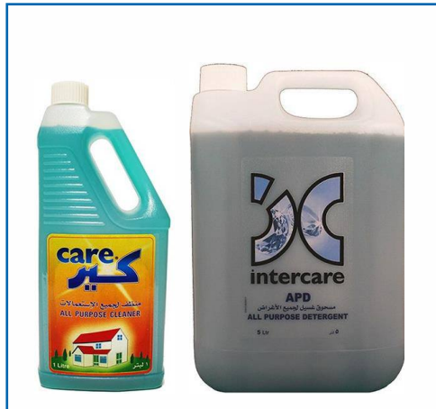
All Purpose Detergent