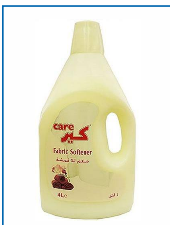
White - Fabric Softener