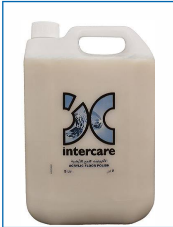
Acrylic Floor Polish