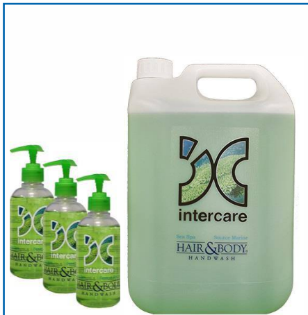
Sea Spa – Liquid Hand Soap