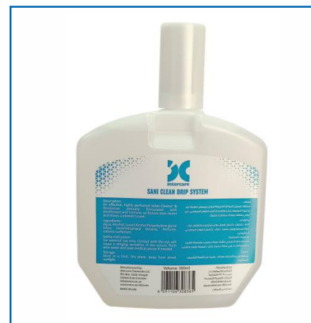
Sani Clean Drip System (Toilet Sanitizer)