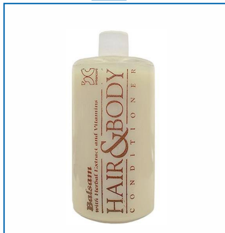
Balsam Hair Conditioner