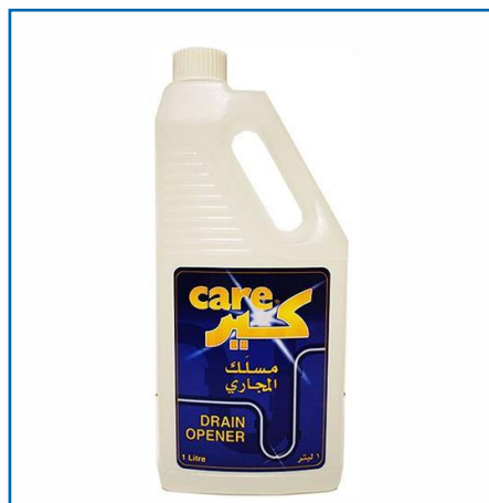
Liquid Drain Opener