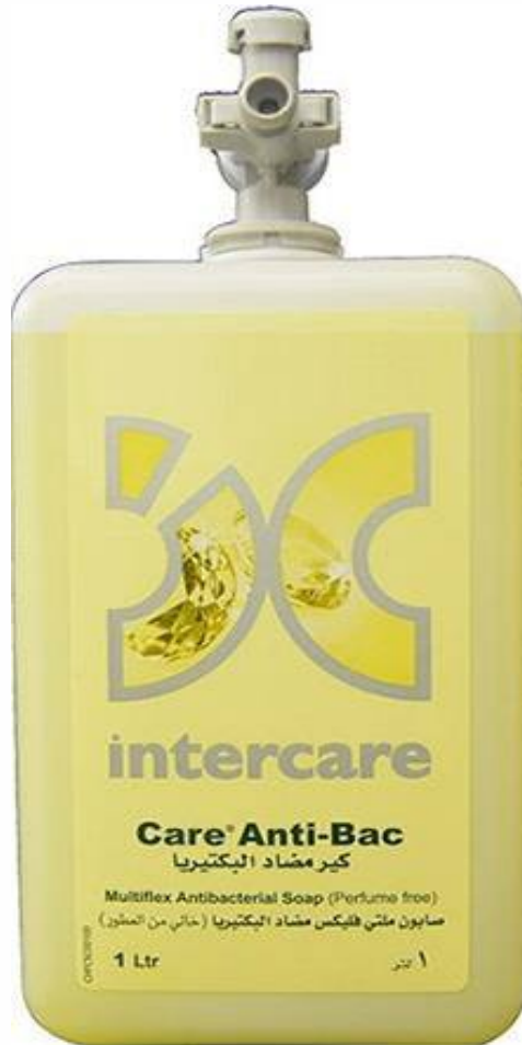
Multiflex Antibacterial Soap