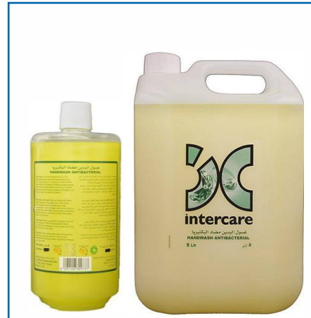
Antibacterial - Liquid Hand Soap