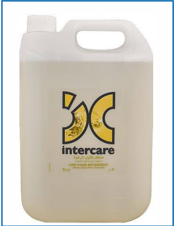
Low Foam Detergent