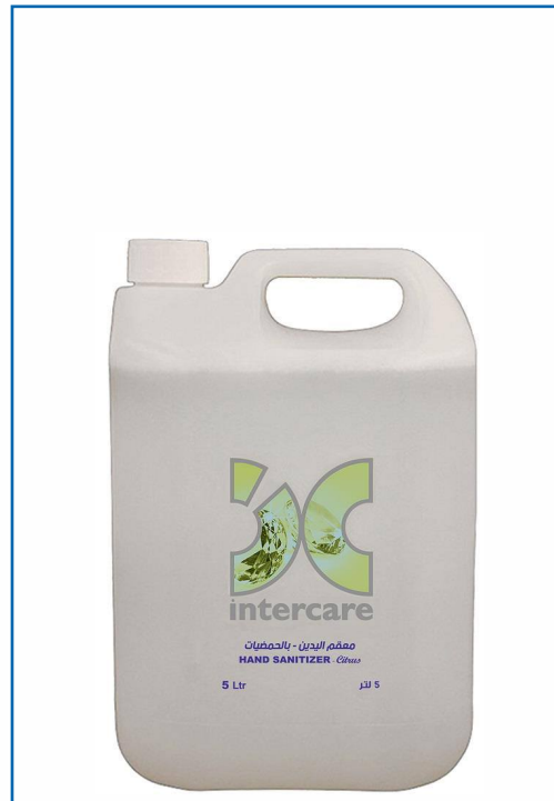
Light Citrus Hand Sanitizer