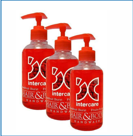
Red Fruit – Liquid Hand Soap