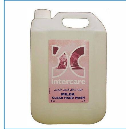
Milda – Liquid Hand Soap