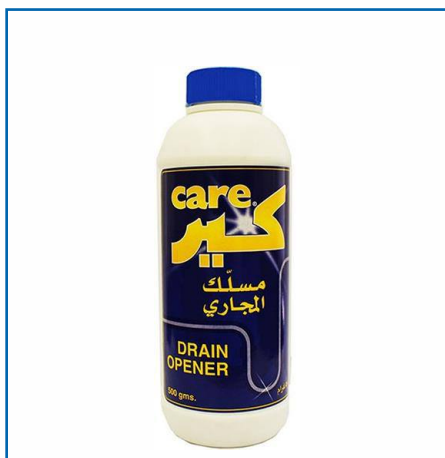
Solid Drain Opener