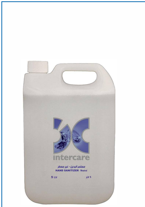
Neutral Hand Sanitizer