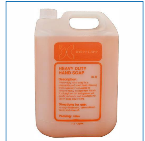
Heavy Duty – Liquid Hand Soap