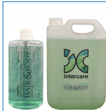
Sea Spa Shampoo