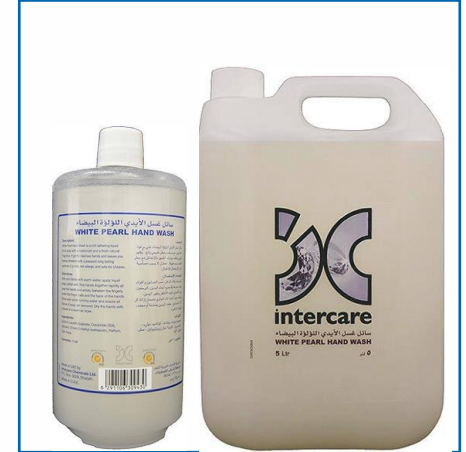
White Pearl - Liquid Hand Soap