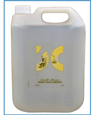
Cement Scale Remover