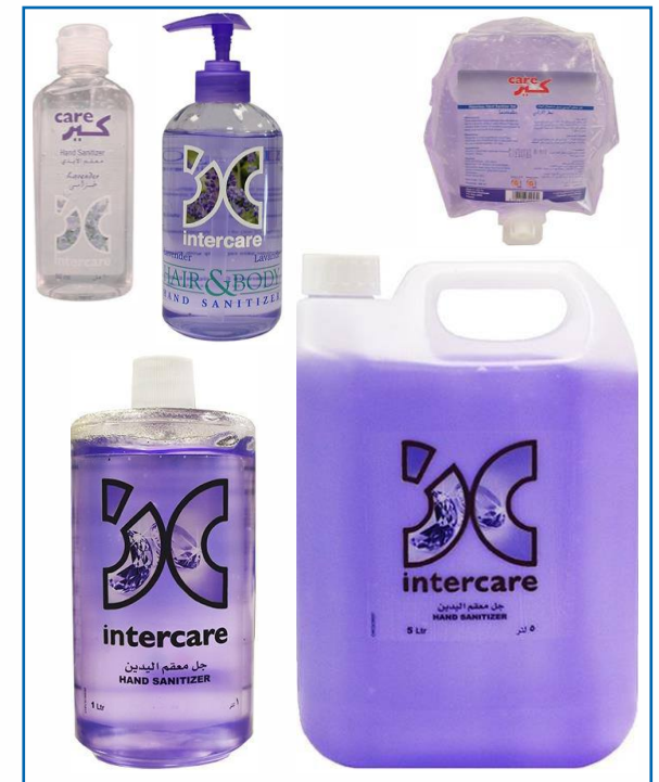
Lavender Hand Sanitizer Gel