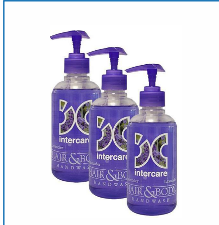
Lavender – Liquid Hand Soap