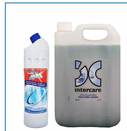
Toilet Bowl Cleaner