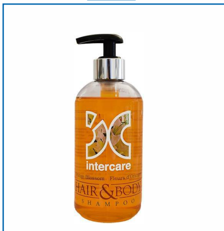
Orange Blossom Shampoo