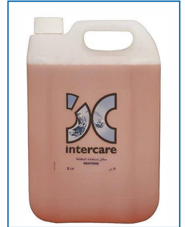
Restore Stain Remover