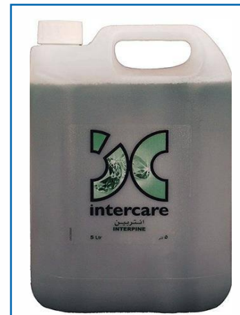
Interpine Floor Cleaner