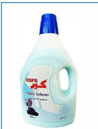
Blue - Fabric Softener