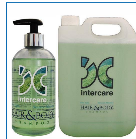
Green Apple Shampoo