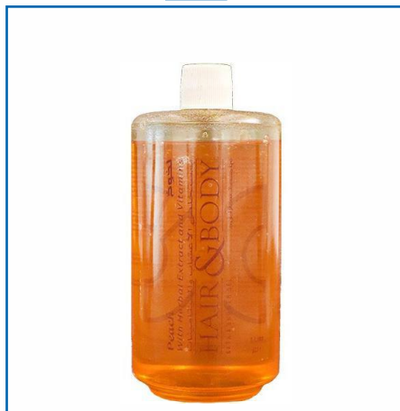
Peach Bath & Shower Gel