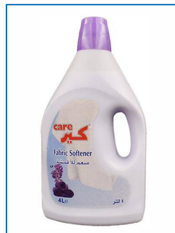
Lavender - Fabric Softener