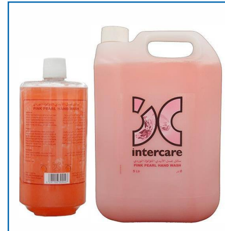
Pink Pearl - Liquid Hand Soap