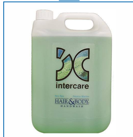
Sea Spa Bath & Shower Gel