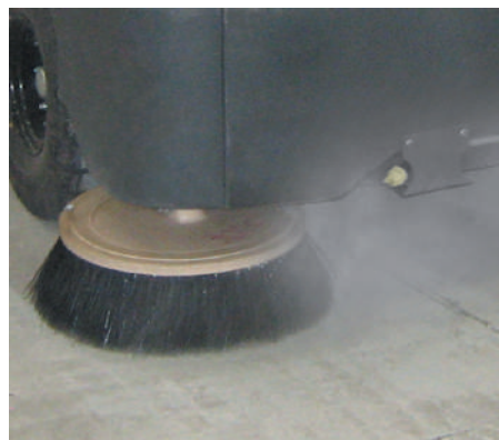
The exclusive DustGuard™ system effectively controls airborne dust by providing a fine mist of moisture to the front and side brushes

PERFORMANCE AND RELIABILITY WITH A CLEAN CONSCIENCE