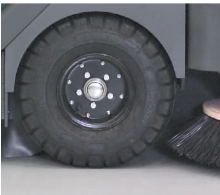
The large wheels give a smoother ride