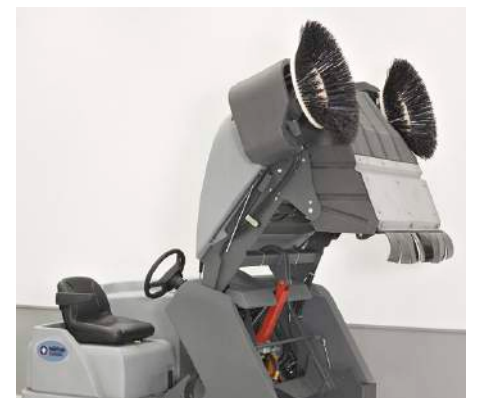
The SW8000 has a superb high-dump capability up to 152 cm from ground level for easy and convenient emptying