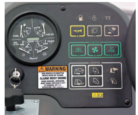
Operation of the SW8000 could not be easier. One-Touch™ control shortens operator-training time and improves the cleaning result